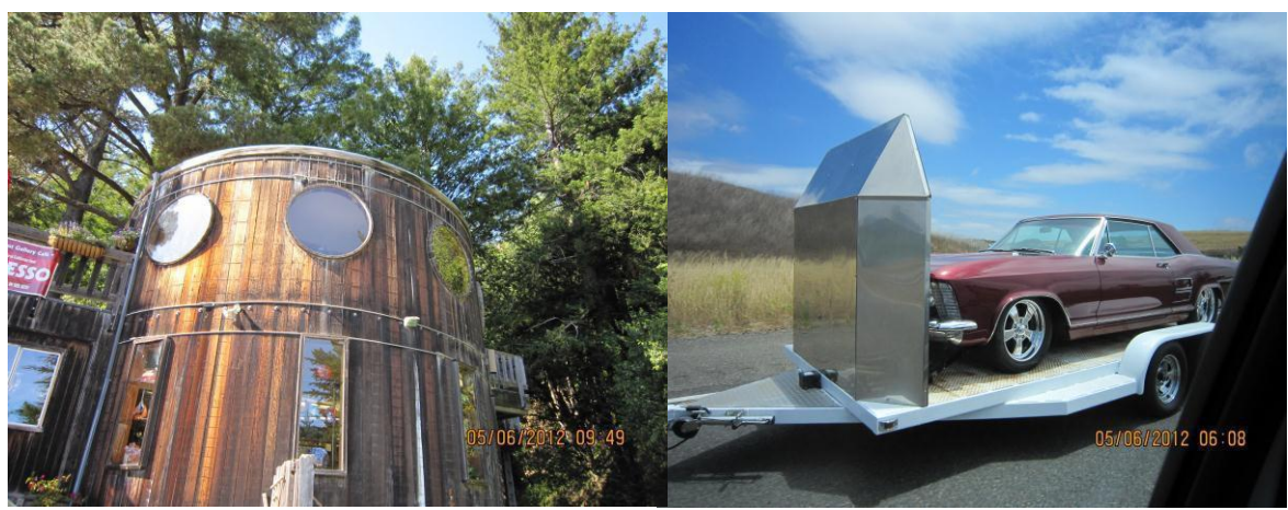
Late lunch stop at interesting eatery On way to Monterey Bay