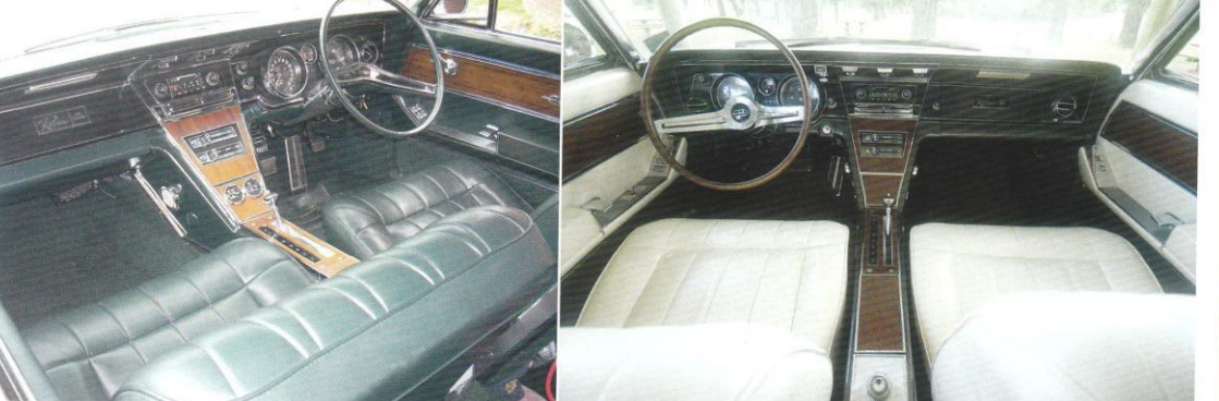
Tom's was converted to right hand drive