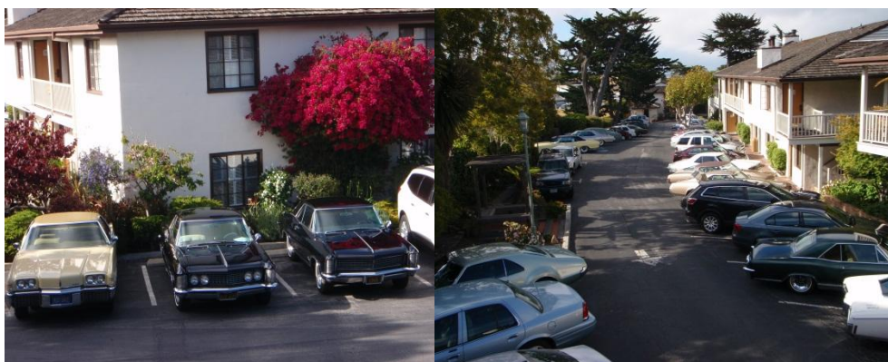
Car park at Casa Munras.