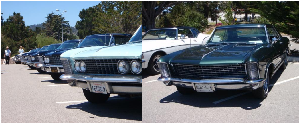
Buicks on display.

On the Thursday there were a total of 72 cars on show, including 61 Rivieras and five Toronados with a 1971 Boat tail winning the car of the show. Steve and I had a ride in a 1965 Riviera Grand Sport. Thursday night the ROA meet concluded with a presentation dinner, speeches and awards and plenty of laughter.