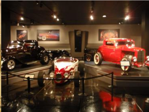
Petersen Automobile Museum