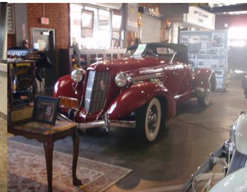
Lairport Automotive Driving Museum