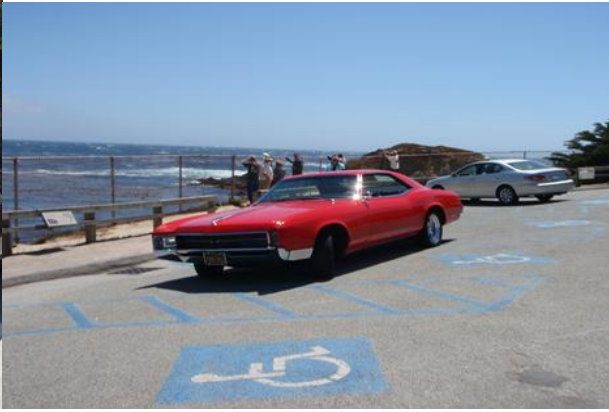
17 Mile cruise.