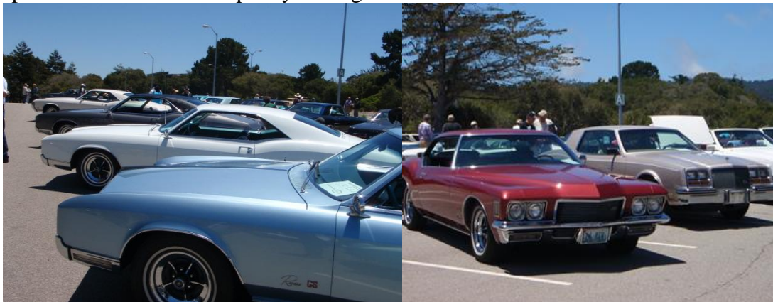
Buicks on display.

On the Thursday there were a total of 72 cars on show, including 61 Rivieras and five Toronados with a 1971 Boat tail winning the car of the show. Steve and I had a ride in a 1965 Riviera Grand Sport. Thursday night the ROA meet concluded with a presentation dinner, speeches and awards and plenty of laughter.